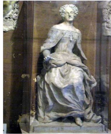
Elena Cornaro Piscopia

After the Second World War, the university has increased its contributions to the development of international scientific institutions. In recent years, it has also been able to meet the problems posed by overcrowded facilities by re-deploying over the Veneto region as a whole.