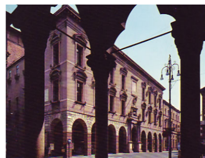
Palazzo del Bo'